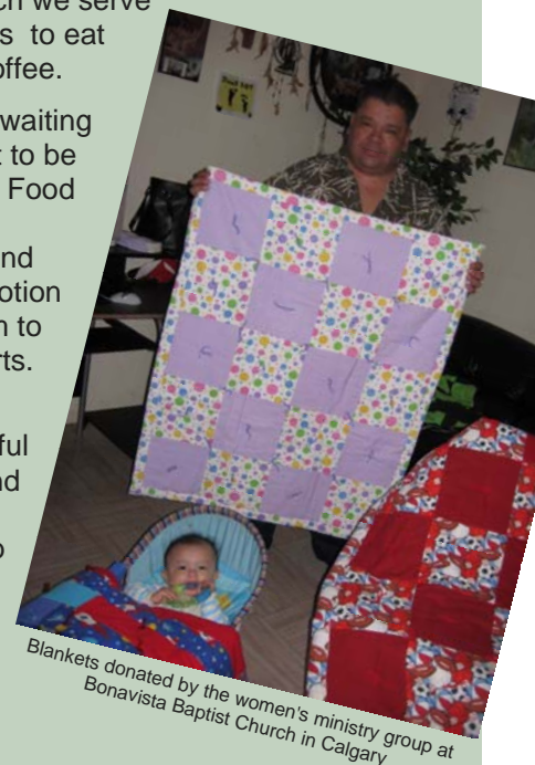
Blankets donated by the women's ministry group at Bonavista Baptist Church in Calgary